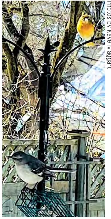
Oriole with mockingbird

Those of you who are experienced more birders than I know what happened next. After sharing the feeder at first, the mockingbird became fiercely territorial, flying at the oriole with wings flapping whenever she - or any other bird - ventured the yard. into desperation, I hung another feeder by the back gate. Maybe the oriole would find this alternate one? luck. No more oriole sightings. Just the everpresent mockingbird. February meals on the