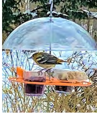
Oriole in snow

Looking thin, her back feathers olive drab as she pecked at the suet, she seemed lost. I say "she" because bird books agreed